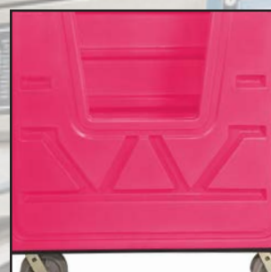
Lower Cut Front