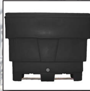
Fork Lift Entry