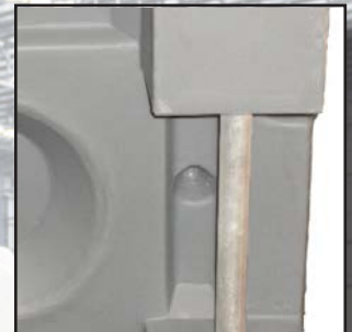
1" Aluminum Bars