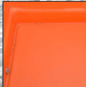
Flat Bottom Interior